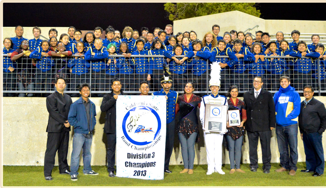
Gahr HS 2013 California State Band Champions

CERRITOS HS MARCHING BAND – The Cerritos HS “Regiment of Gold” Marching Band received 1 st Place at the WBA Competition located at Trabuco Hills HS in Mission Viejo. In addition the Band received caption awards in the following areas: Best General Effect, Best Music, Best Visual, Best Percussion, and Best Colorguard. The Band is currently undefeated and holds the highest score in all of Division 2A and will headed up north to Fresno for the 2013 WBA State Marching Band Championships.