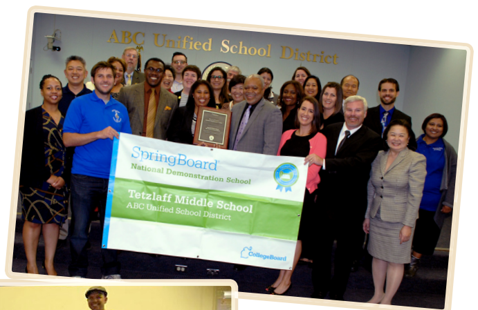
Tetzlaff MS honored as a National Demonstration School by the College Board at the November 6 Board of Education Meeting.

SpringBoard is the College Board’s college readiness program in English language arts and Mathematics. A research based program, SpringBoard is a pre-Advanced Placement Program that increases participation and prepares a greater diversity of students for success in AP and college by providing culturally and personally relevant activities designed to engage students in problem solving and critical analysis. ▶