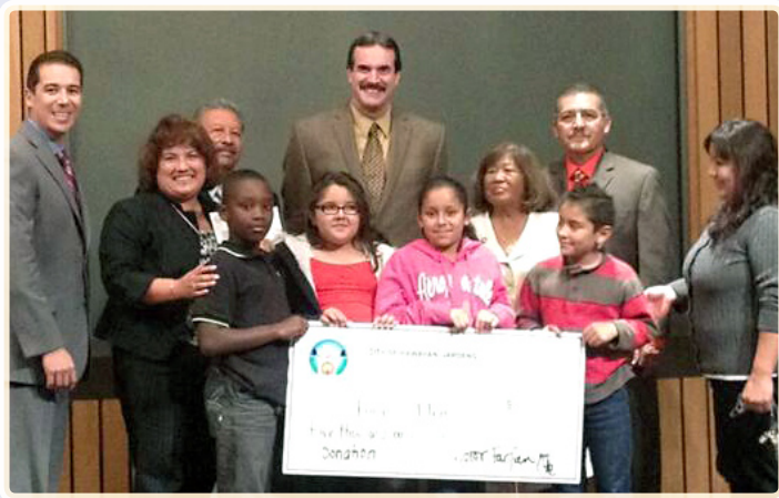
City of Hawaiian Gardens Award to Furgeson ES for raising student achievement

The Hawaiian Gardens City Council presented an award of $5,000 to Furgeson ES and $2,500 to Melbourne ES for breaking 800 on the Academic Performance Index on Nov. 12, 2013. Furgeson ES has an API of 800 and Melbourne ES reached 814 this year. The City of Hawaiian Gardens has supported our schools serving students and families in Hawaiian Gardens for many years. This is only one of many ways that they have contributed to our District in advancing their City's theme of "Our Youth, Our Future."