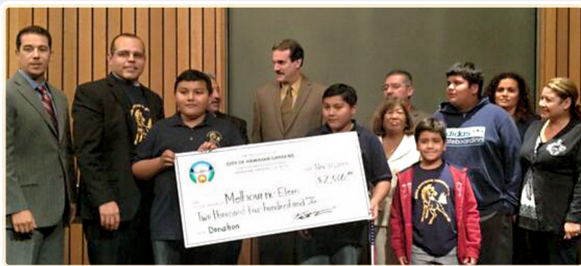
City of Hawaiian Gardens Award to Melbourne ES for reaching 814 on their API.